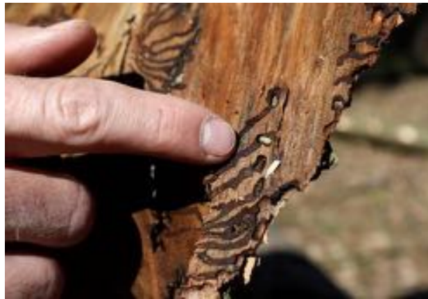
Pests (e.g. bark beetles)