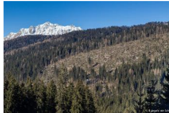
Storms and windthrows